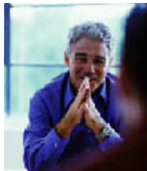
panel 2 (inside)